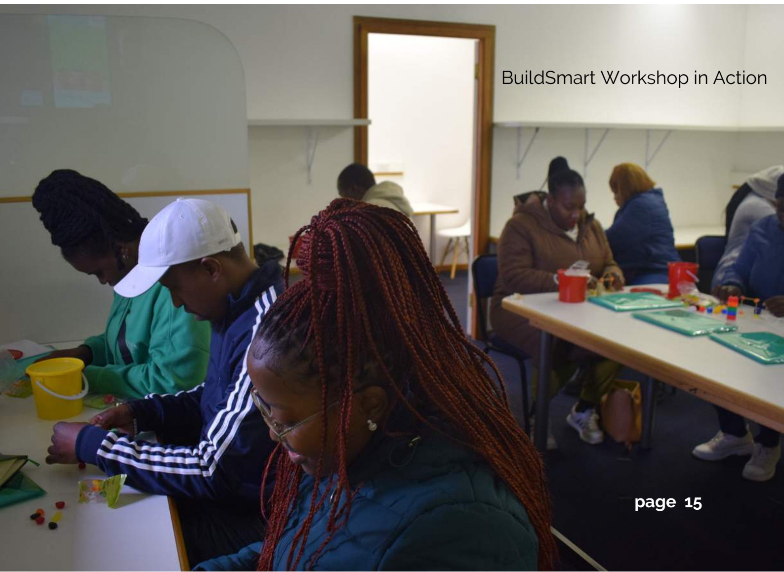
BuildSmart Workshop in Action

Thank you Valcare, the Ackerman Family Foundation Trust, the Rolf-Stephan Nussbaum Foundation, the Lombardi Family Charitable Trust and individual donors for your kind financial support towards our Child Protection Empowerment Programme. We so appreciate it that you share this empowerment journey with us. Together with other child protection stakeholders we can do so much more to strengthen the child protection system in order to enable change for children.